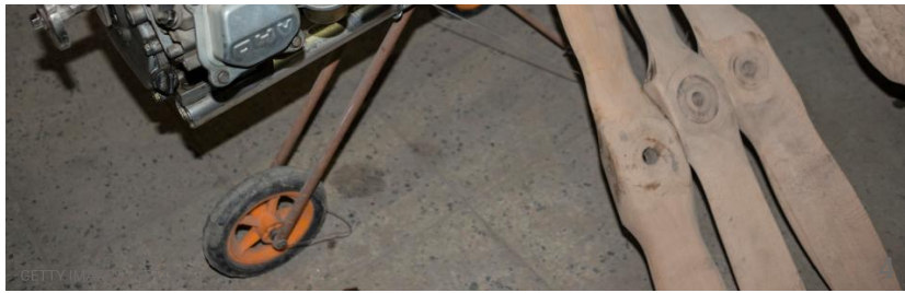
A drone and a mobile IED at an ISIS factory discovered by Iraqi forces last year

ISIS release shocking footage of suicide car bomb attacks filmed from a drone