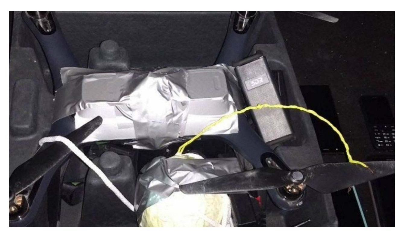
Mexico's Federal Police discovered an IED attached to a drone during a security check near Guanajuato.

The recent arrest in Mexico of four men carrying a drone equipped with an improvised explosive device "ready to be detonated" has stoked fears drug cartels could soon target the U.S. with bombs from above.